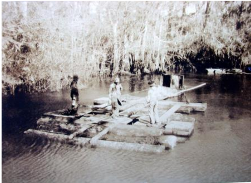
Lumber bound for Pensacola was transported down Holmes Creek on rafts.